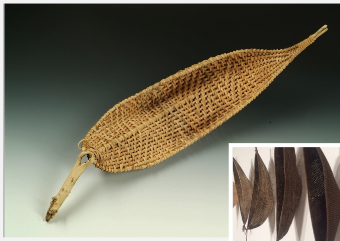
GREAT SOUTHERN WORKSHOPS

Weaving materials are supplied. Mary's Link... http://www.maryhetts.com/